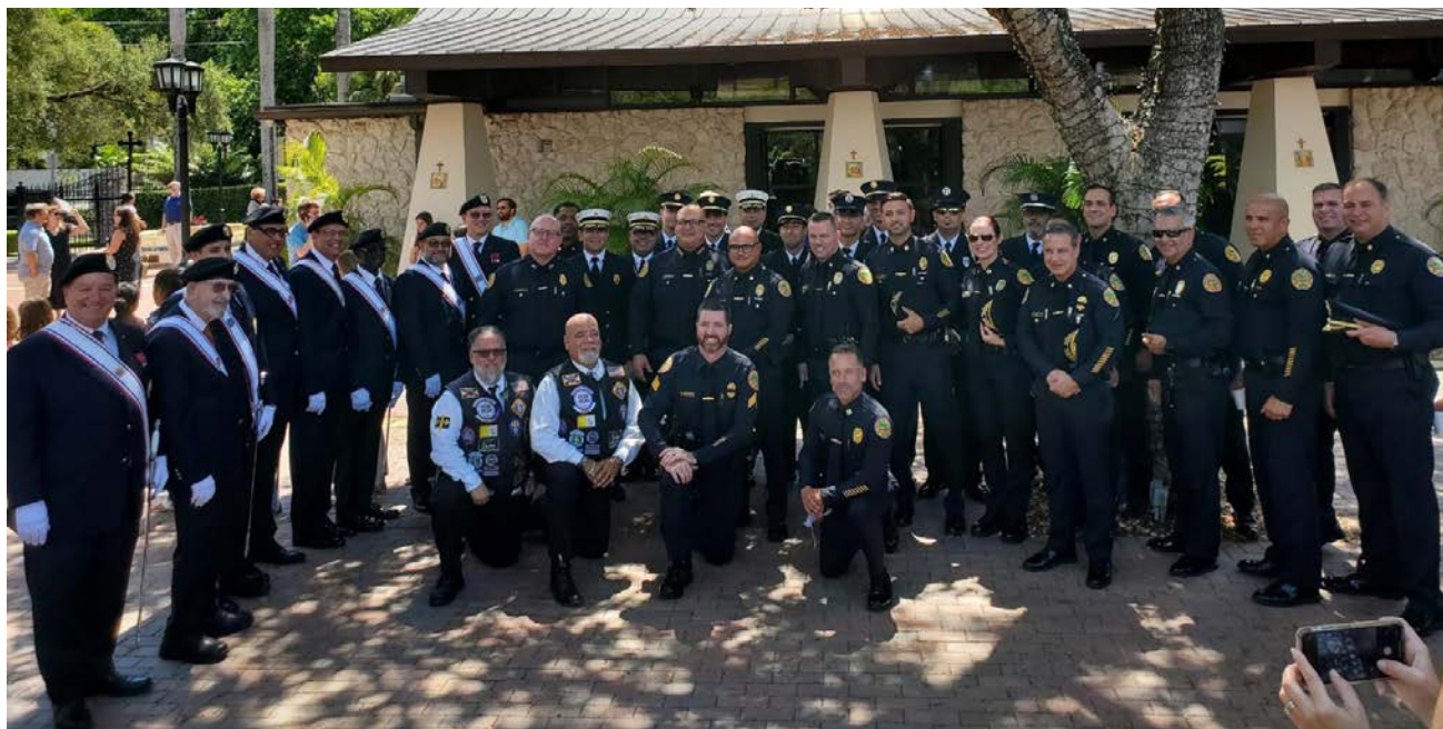
Annual 9/11 Blue Mass at St. Hugh. The Miami Council 1726 has been sponsoring this event for many years.

Are there ways you see yourself as a lost sheep, a prodigal son? What concrete steps can you take to overcome sinful habits and avoid temptations? Do you “come home” to the Father to receive his mercy and forgiveness in the sacrament of reconciliation?