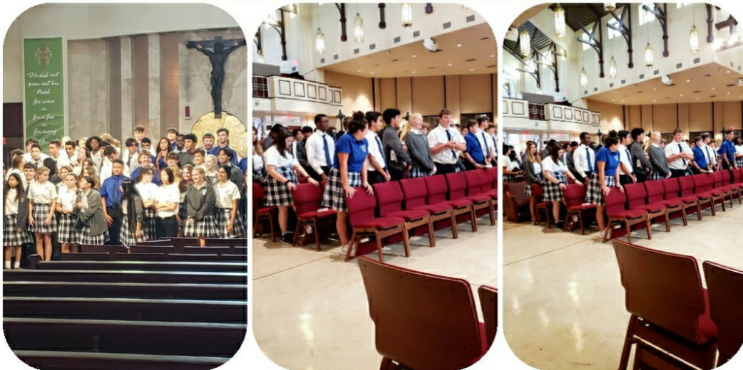
Together "We Did" Knights of Columbus Assembly and Councils of Gainesville areas joined together to deliver Bibles to Queen of Peace Catholic Church.